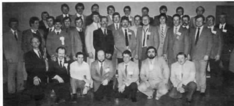
The picture tells it all.

fifth reunion. Outside of the rebuilt friendships, the greatest benefactors were Molsons and Bayers.